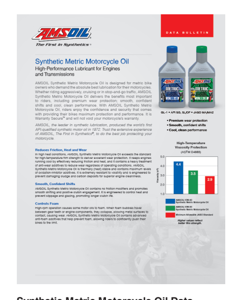
Synthetic Metric Motorcycle Oil Data Bulletin (G3348)

All trademarked names are the property of their respective owners and may be registered marks in some countries. There is no affiliation or endorsement claim, express or implied, made by their use. AMSOIL products are formulated to meet or exceed the performance requirements set forth by the manufacturers of all applications shown here.